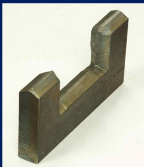
Precise Weld Prepared Part (no grinding)